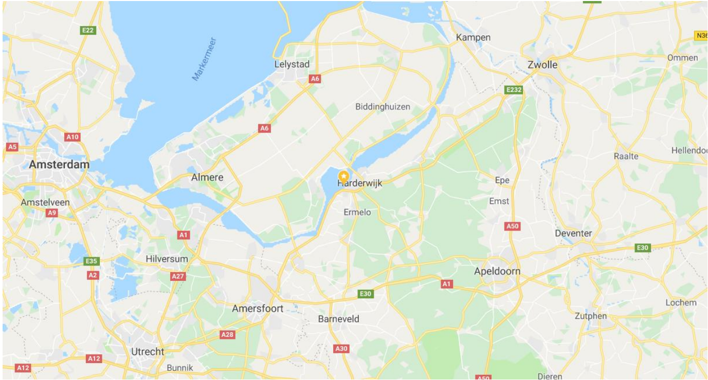
Watersportvereniging Flevo/Jachthaven De Knar, Knarweg 2-4-6, 3846 AH, Harderwijk (The Netherlands)