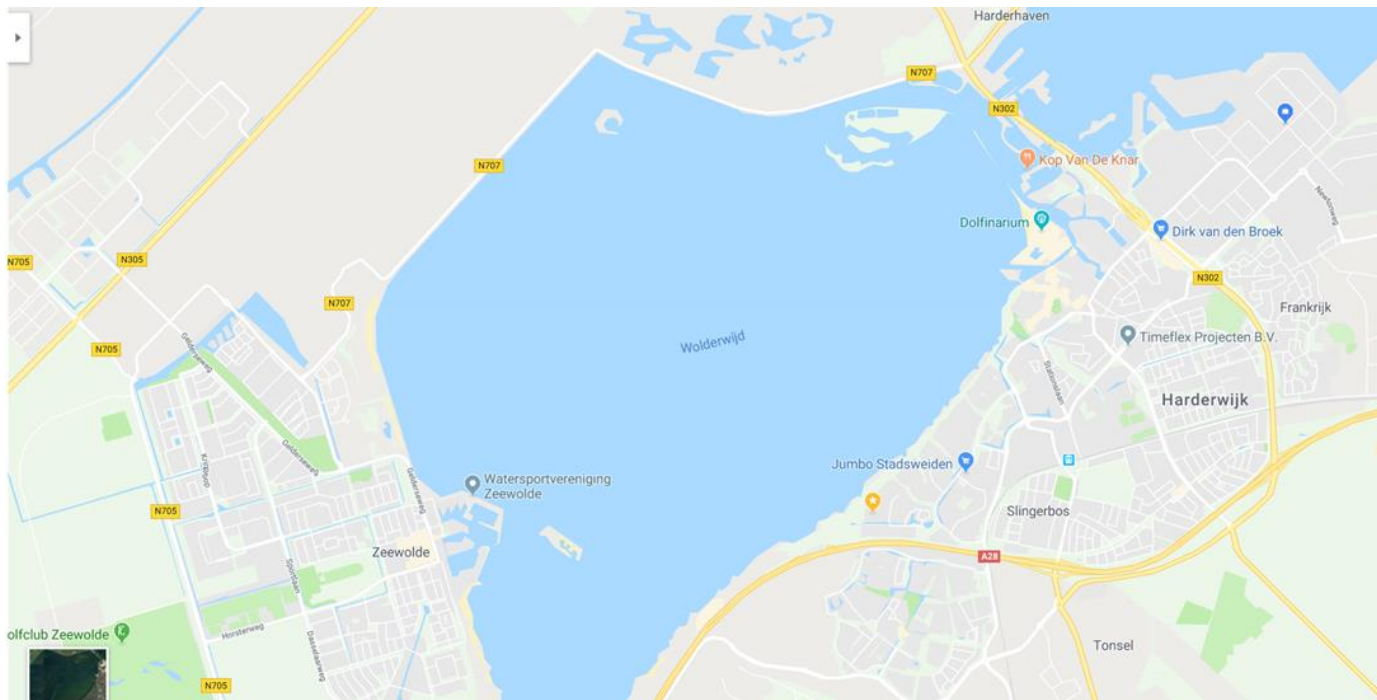
Watersportvereniging Flevo/Jachthaven De Knar, Knarweg 2-4-6, 3846 AH, Harderwijk (The Netherlands)